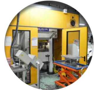
Blanking (10 M/c)