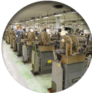
Screw machining (82 M/c)