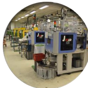
Plastic injection (27 M/c)