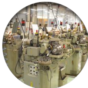
Gear cutting (55 M/c)