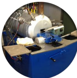
Head Treatment (hardening and tempering)