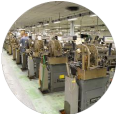
Screw Machines (82 M/c)