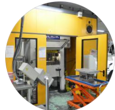
Blanking (10 M/c)